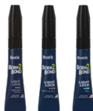
5g alu tubes for LIGHT LOCK MV, HV & Gel

The first odorless light-curing cyanoacrylate