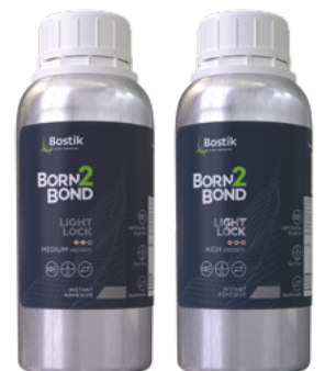
500g bottles for LIGHT LOCK MV & HV