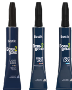
20g alu tubes for LIGHT LOCK MV, HV & Gel