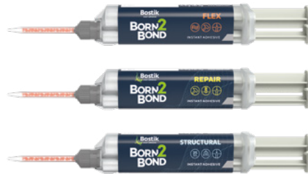
10g syringes for FLEX, REPAIR & STRUCTURAL

Two-component adhesives with advanced properties