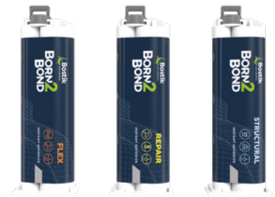
50g syringes for FLEX, REPAIR & STRUCTURAL